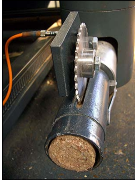
Automatic Briquette Length Control

The comprehensive Weima range of circular and square briquette producing machines operate without the use of any chemical additives being added to the materials, and are produced purely by hydraulic compression alone. Relying on the natural lignin and cellulose that are present in the waste material being processed, these act as a binding agent, with briquette volume throughputs of approximately 40 kg/hr (entry level model) up to approximately 700 kg/hr.